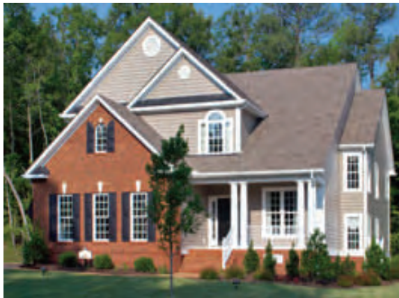
Stylecraft Model Home

The application can be found in the back of the FoxCreek Design Standards, at www.foxcreek-hoa.com , or can be obtained by calling Community Partners, LLC at (804)560-4260.