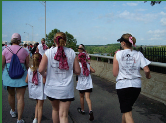
The Ladies at FoxCreek and their daughters participated in Race for the Cure on May 10th.